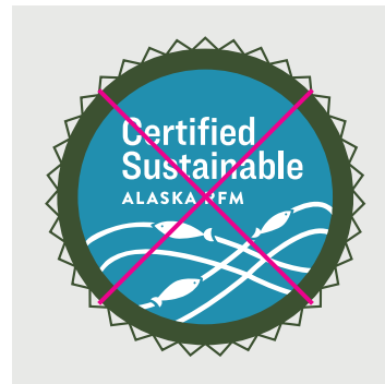
No decorative borders