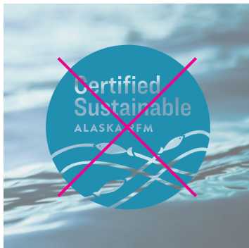
Knocked out area requires min. contrast of 5:1